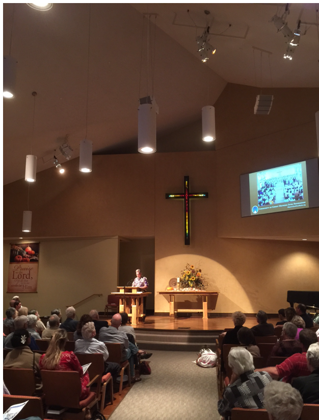
Storytellers sessions, like the one at the Woods Chapel Congregation in Lee's Summit, Missouri, are entertaining and educational.