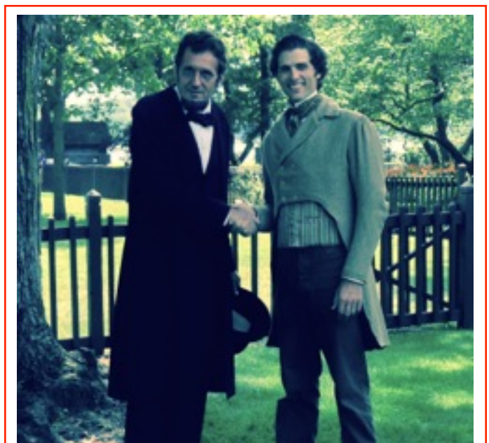
An actor portraying former President Abe Lincoln greeted Joseph Smith Jr. at Nauvoo in July.