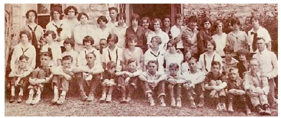
Guests and workers from long ago (above) and recent years (below) have found Nauvoo's charm.