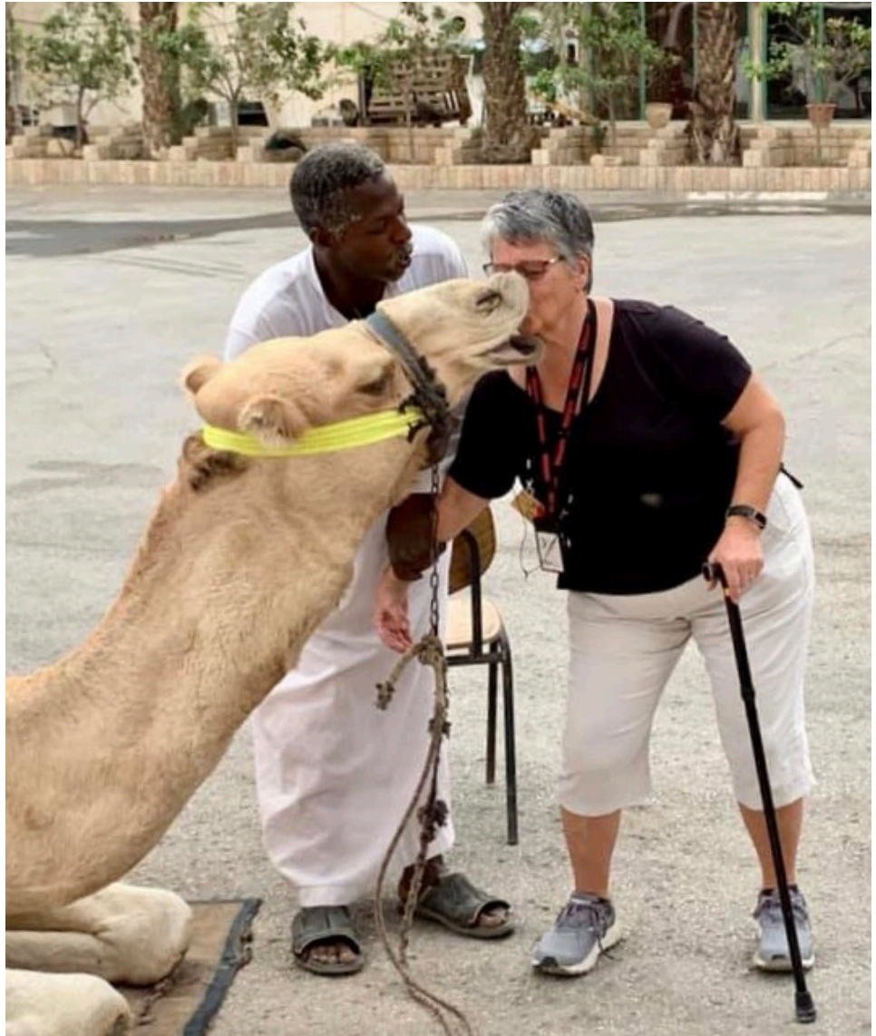
The trip gave some guests an opportunity to extend warm greetings.