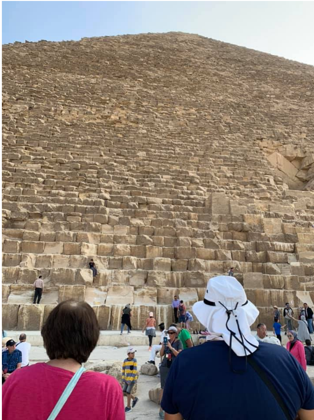
The immensity of the pyramids inspired great awe and wonder among many visitors.