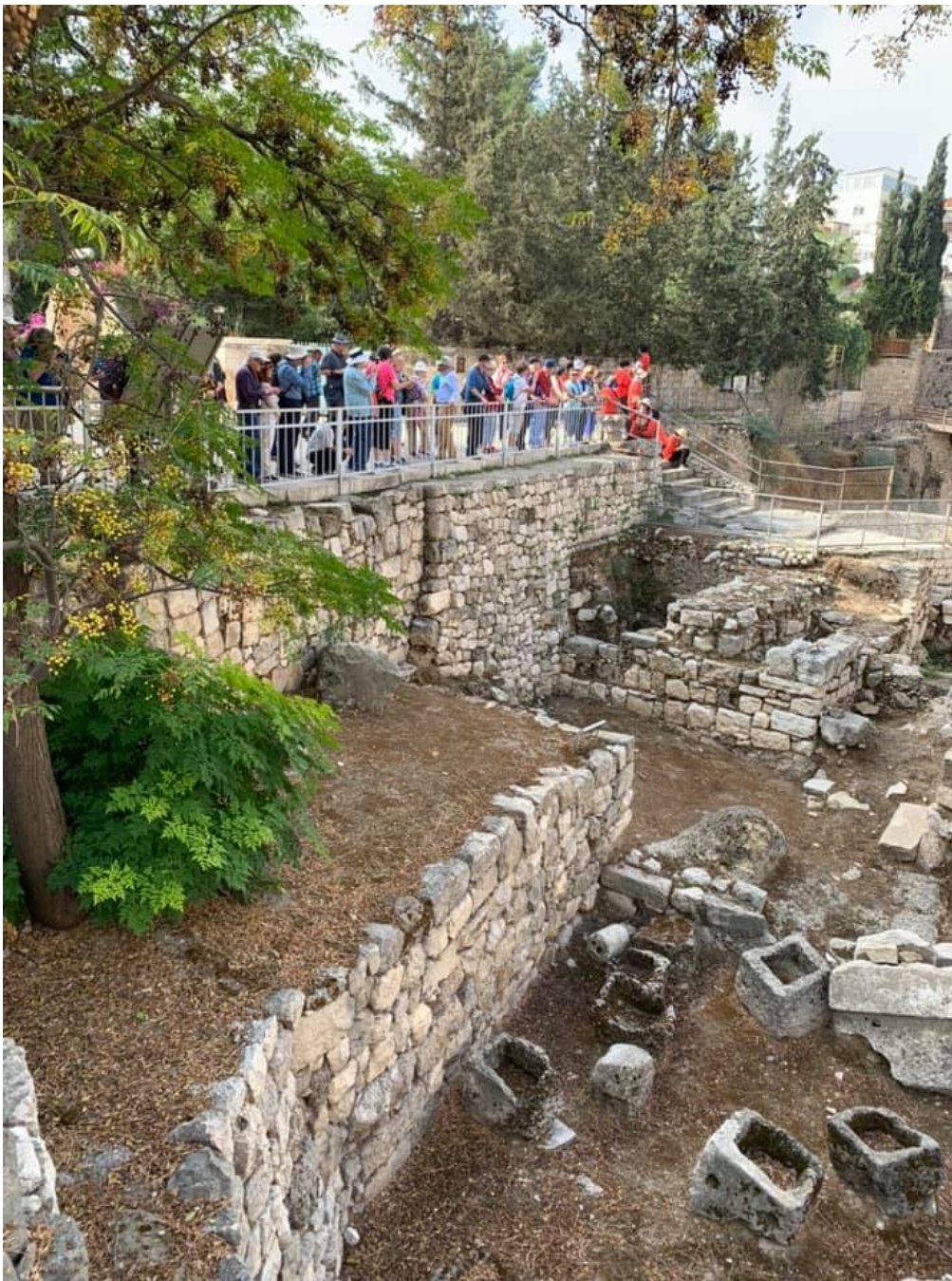
Tour guests became well acquainted with relics and sites from another era.