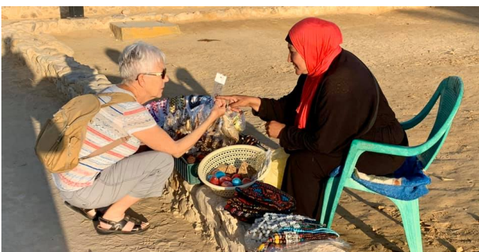
Besides visiting famous antiquity sites, guests experienced biblical waterways (top) and sampled local culture.