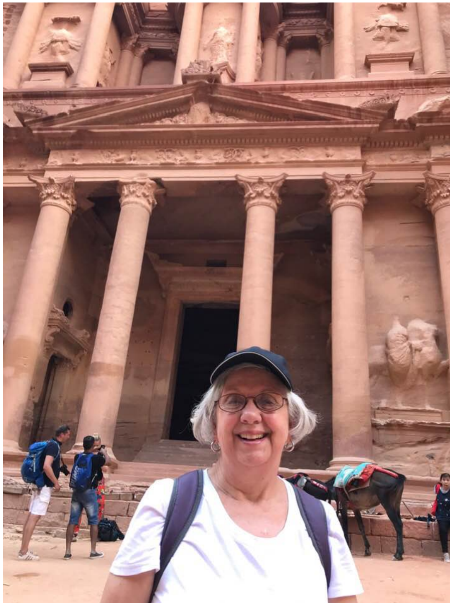
The Treasury at Petra, renowned in an Indiana Jones movie, brought smiles galore.