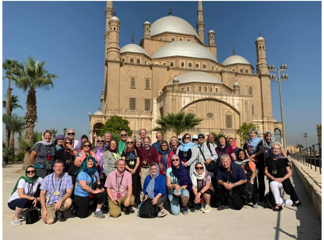
The Holy Land Tour provided life-changing stops and experiences.

The social network is a big hit with many historic-site fans. Visit www.facebook.com and www.instagram.com to learn more.