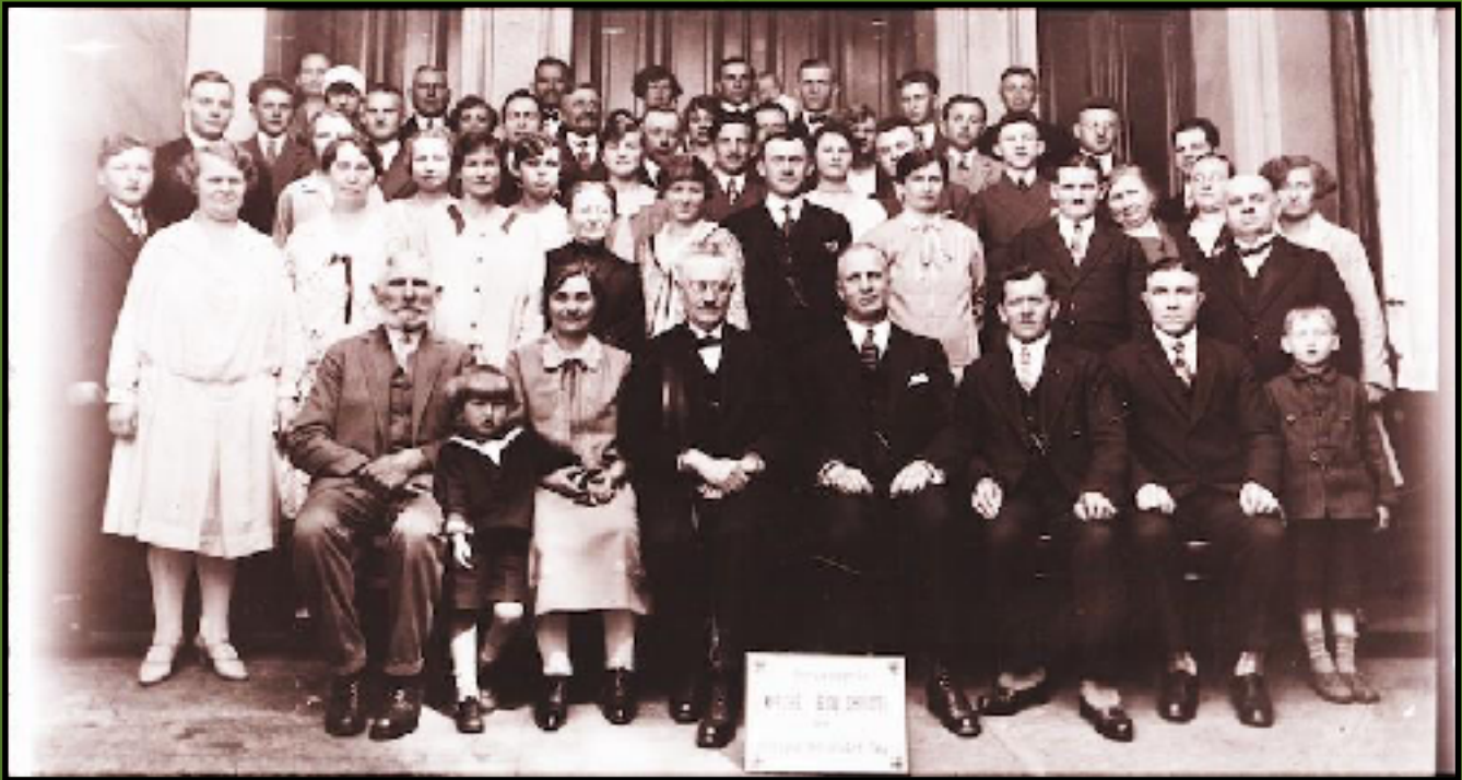
Image features early church members living in Germany.