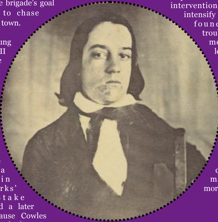
Photo of young Joseph Smith III

Though thirteen-year-old Joseph attempted to stop the harassment, his intervention seemed only to intensify their efforts. He found it especially troubling that church members who had long complained of the “intolerance of bigotry” had themselves become bigots. The persecuted had become persecutors. Joseph wrapped up his story with a plea that God would “soon send the day when the curse of intolerance may be known no more in the land.”