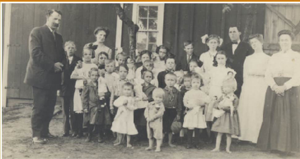
Youth and adults gathered at the Children's Home in Lamoni.