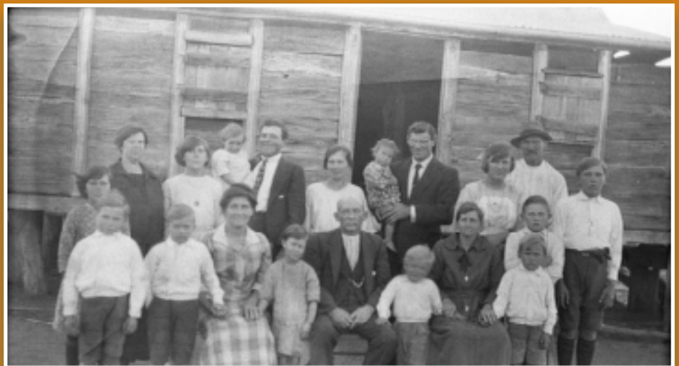
Youth gathered for Sunday School in Southern Australia, circa 1924.