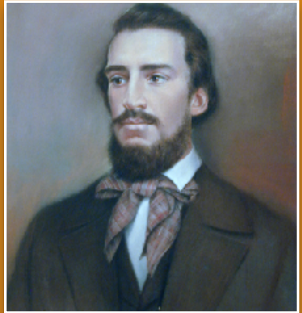
Portrait of Joseph Smith III.