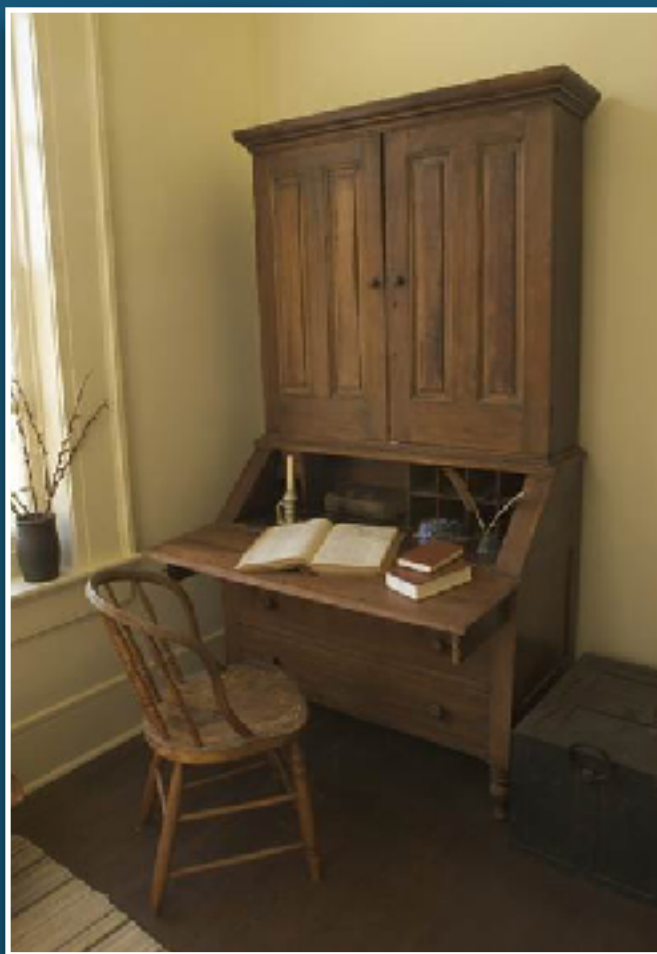
Whitney desk on display at the Red Brick Store