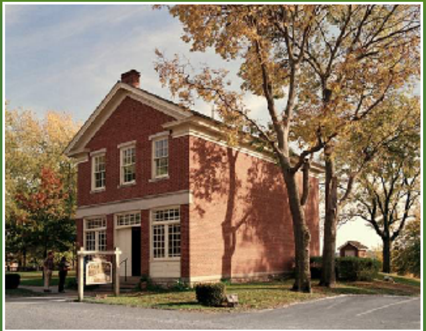
Red Brick Store (above) in Nauvoo, Illinois