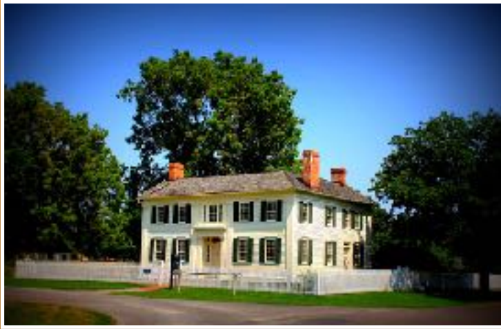
Mansion House in Nauvoo, Illinois.