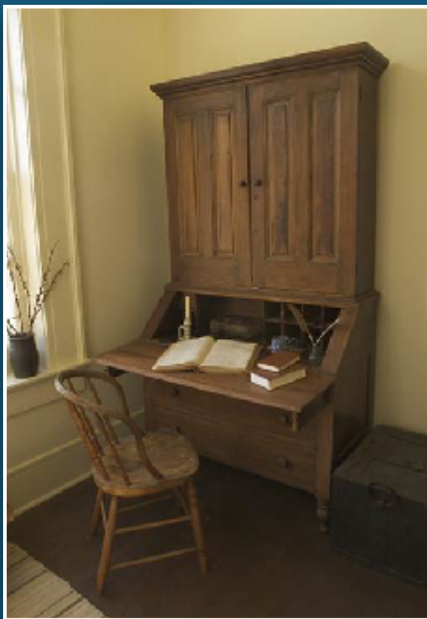
The Whitney desk on display at the Red Brick Store in Nauvoo, Illinois