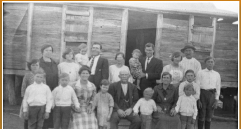
Youth gathered for Sunday School in Southern Australia, circa 1924.