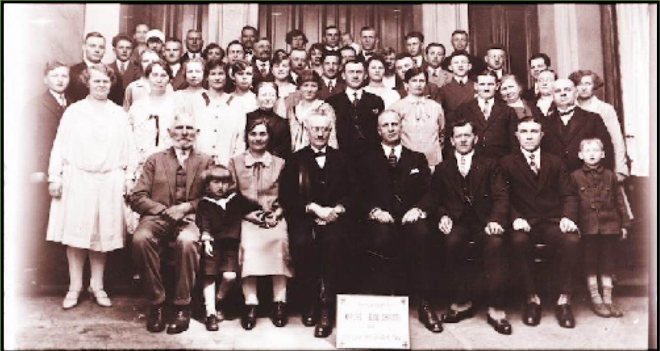
Image features early church members living in Germany.