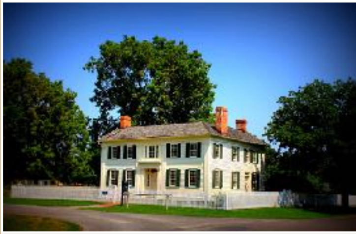
Mansion House in Nauvoo, Illinois.