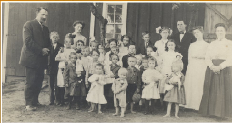
Youth and adults gathered at the Children's Home in Lamoni.