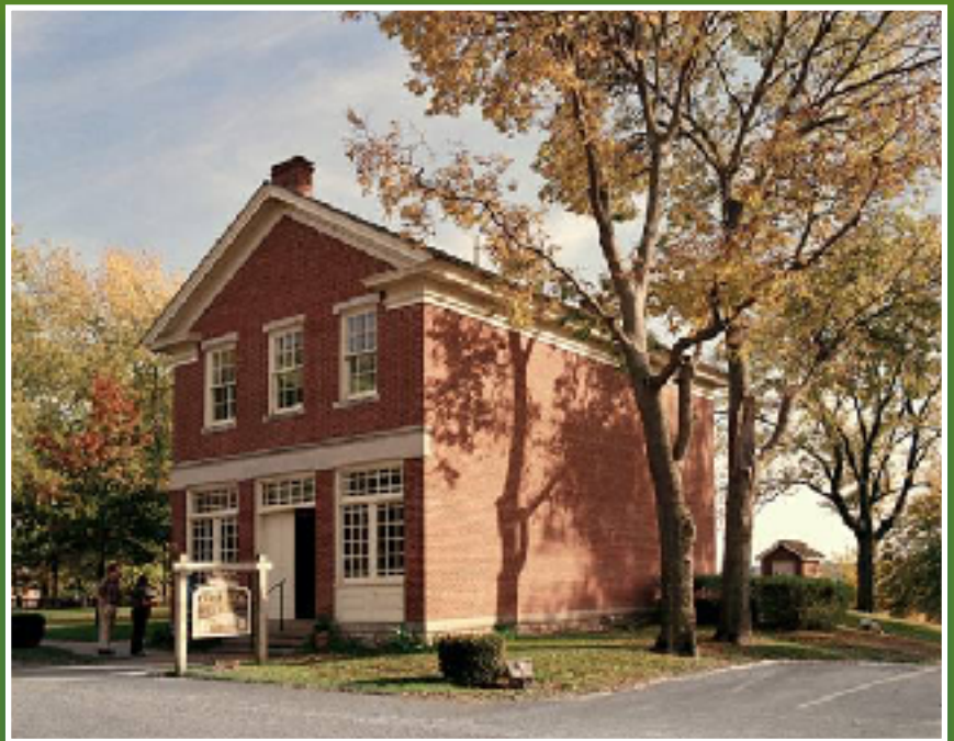
Red Brick Store in Nauvoo, Illinois