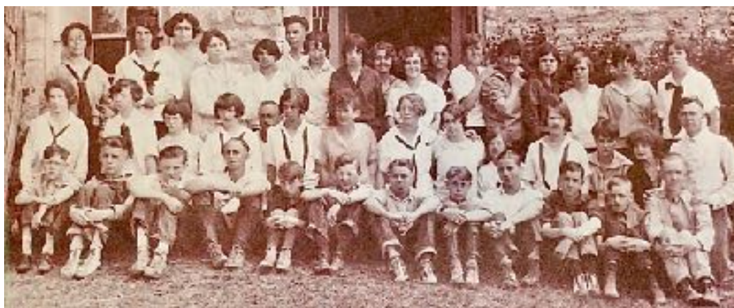
Guests and workers from long ago (above) and recent years (below) have found Nauvoo's charm.